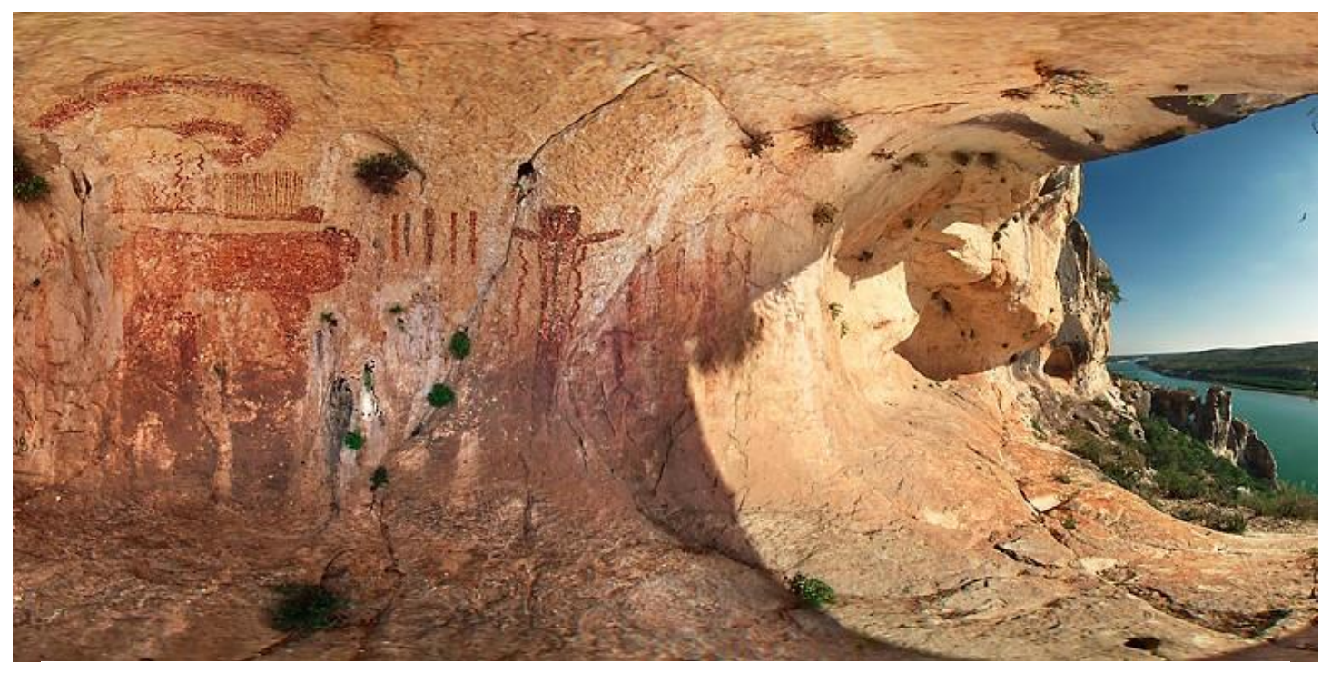
The White Shaman Mural on the Pecos River. The Antiquities Act was passed to protect such sites from looters.