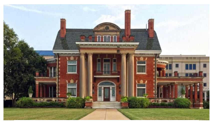
Thistle Hill-Historic Fort Worth, Inc.

Sometimes, not all parts of a city were listed in the Directories even if there were structures on the street. Address numbers also changed as structures were added to the street. Structures were also moved from one location to another adding confusion regarding dates of construction.