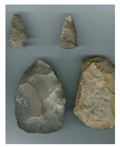
Objects found in a Native American grave site are protected under the Archaeological Resources Protection Act.

Primary regulations governing the protection of archaeological resources are set forth at 43 C.F.R. Part 7. Regulations pertaining to the preservation of American antiquities are codified at 43 C.F.R. Part 3 and regulations concerning the care of federally-owned and administered archaeologically collections are located at 36 C.F.R Part 79. These laws and additional information are available on the National Park Service's website at http://www.nps.gov/Archeology/sites/FEDARCH.HTM.