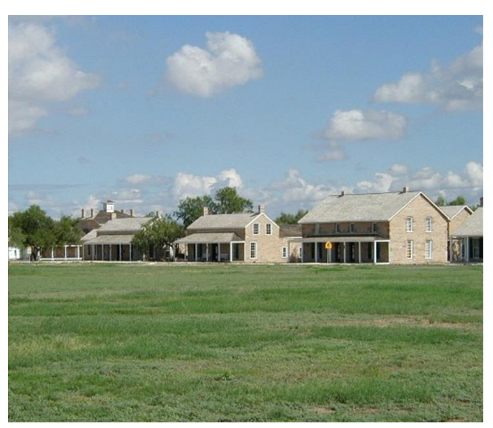
Fort Concho. A National Historic Landmark listed in the National Register.

In a very limited number of states, compensation may be required upon a showing a by a private owner that the value of his or her property (and, in some cases, a portion of that property) has been diminished by a certain percentage (sometimes as low as 10 percent). While highly controversial, the impact of takings laws on historic preservation has not been documented. Nonetheless, because historic preservation laws may affect private property, these laws are likely to have some impact on efforts to regulate historic property and should be consulted where applicable.