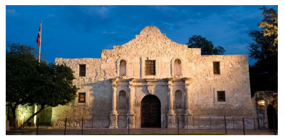
The Alamo is listed in the National Register and is also a National Historic Landmark