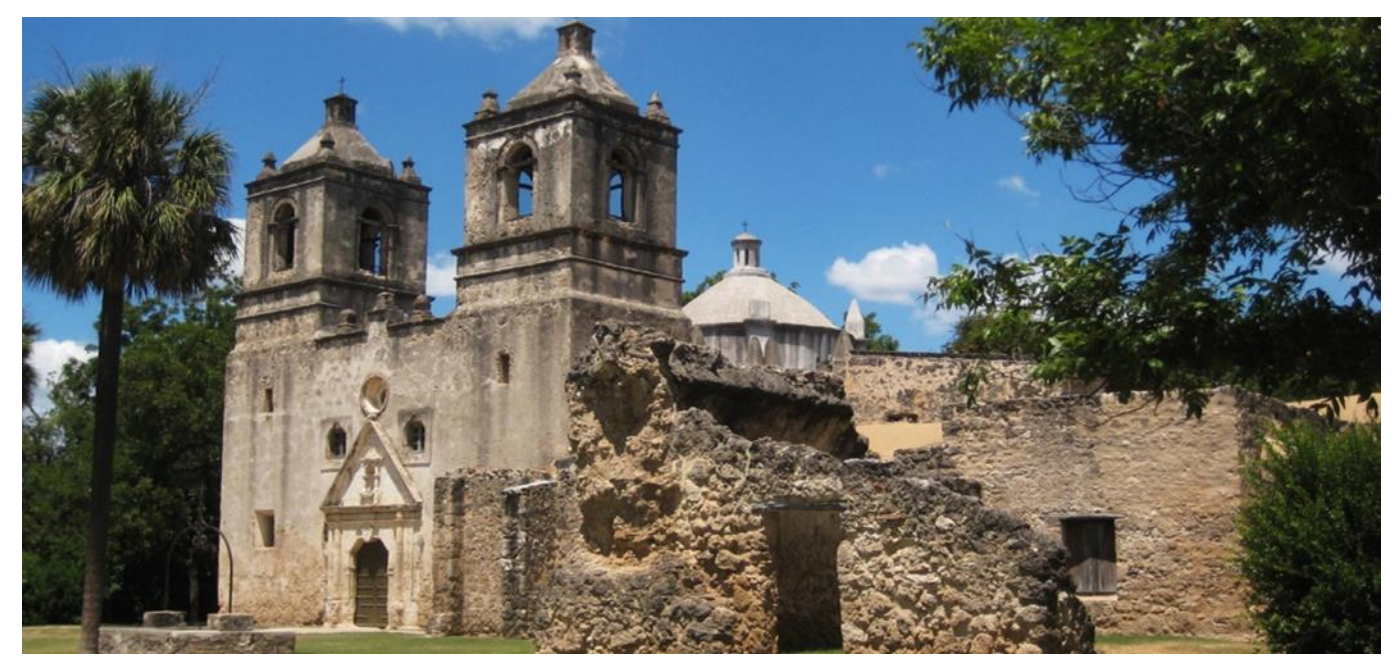
Mission Concepcion in San Antonio is listed in the National Register and is a National Historic Landmark.

The Supreme Court in Smith, however, recognized two limitations on its general rule that substantial burdens on the free exercise of religion need not be justified by a compelling governmental interest: (1) where the government "has in place a system of individual exemptions;" and (2) where the substantial burdens involves another constitutionally protected right. There is little guidance on the law in this area. Constitutional experts maintain that exceptions under historic preservation laws, such as "economic hardship provisions," do not trigger the "individualized exemptions" limitation because they do not invite "religiously motivated discrimination." See, e.g., Laura S. Nelson, "Remove Not the Ancient Landmark: Legal Protection for Historic Religious Properties in an Age of Religious Freedom Protection," 21 Cardozo Law Review 740-753 (Dec. 1999). Compare Keeler v. Mayor & City Council , 940 F. Supp. 879 (D. Md. 1996) (exemptions in Clumberland historic preservation ordinance made law not neutral and generally applicable as a matter of law). While some religious property owners have argued that historic preservation laws fall into the "hybrid" constitutional rights limitation on the basis that such laws infringe on both free exercise and free speech rights, no court has applied this limitation in the context of historic properties.