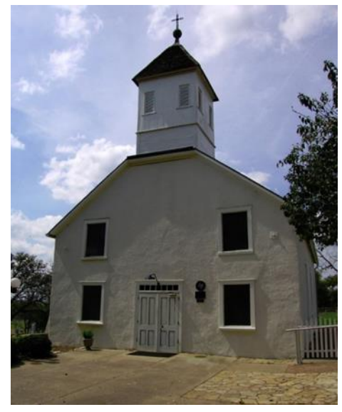
Bethlehem Lutheran Church, Round Top, TX

Historic preservation laws are generally viewed as "neutral laws of general applicability." The object of such laws is to promote the preservation of historic properties, rather than the suppression of religious conduct. Moreover, they seek to preserve all historic properties, whether secular or religious, and without regard to the religious orientation of the property owner. See, e.g. Rector, Warden & Members of the Vestry of St. Bartholomew's Church v. New York City, 914 F. 2d 348 (2d. Cir. 1990), cert. denied, 499 U.S. 905 (1991) (New York City's landmark law is neutral of general applicability); First Church of Christ v. Ridgefield Historic District Comm'n, 737 A. 2d 989 (Conn. App. 1999), (Ridgefield historic preservation ordinance is neutral law of general applicability); and City of Ypsilanti v. First Presbyterian Church of Ypsilanti, No. 191397 (Mich. Ct. App. Feb. 3, 1998) (Ypsilanti preservation ordinance is "a law of general application which does not burden the church any more than other citizens, let alone burden [the church] because of its religious beliefs.").