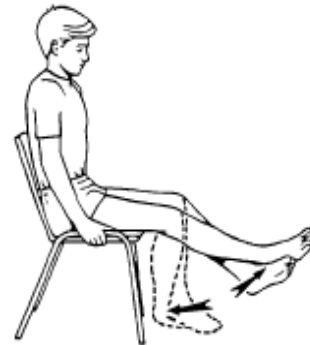
Ice Position 15 minutes 2-3 x per day