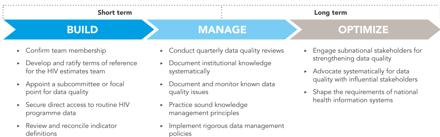
Figure 3. Recommended phases of implementation to ensure high-quality national estimates

The standards of practice are organized by three phases of implementation (see Figure 3): Phase 1—Build, Phase 2—Manage and Phase 3—Optimize. Build phase activities are designed to be completed within two months. The Manage phase should be targeted for implementation in the short to medium term (three to six months) and the Optimize phase activities may be more complex or long term in nature. Country teams may assess their own routines against these standards and develop a phased work plan to adopt, implement and monitor the implementation of these practices. By working in conjunction with existing national data quality initiatives, estimates teams can improve the quality of their programme data and, subsequently, the quality of their HIV epidemiological estimates.