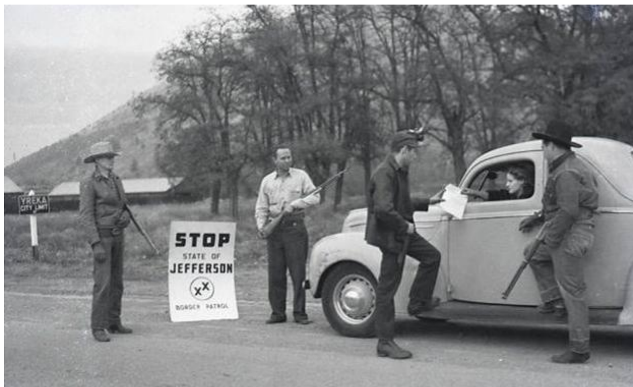
Figure 4. The 1941 State of Jefferson secessionists hand out their “Proclamation of Declaration” to a passing-by traveler.

impoverished how the region is understood formally. Talk about Jefferson, so tightly tethered to secessionism, often centers on the question of feasibility. Do you think it can happen? This is surely a dead-end line of inquiry. 1 Discussions that do transcend the question of feasibility are generally severely constrained in their narration because secessionism in the region has failed to produce political borders. Jefferson is therefore commonly narrated as “mythical” (e.g. Sutton, 1965; Shaw, 2000; Magee, 2005; Schwartz, 2013). The suggestion that the region is somehow unreal discounts the fundamental realities of physical and historical geography (topography, natural resources, settlement, traditional economic activities) that have played out within a specific geographic context. Such narration serves to distract from the real-life and everyday struggles of economic transformation, political disputes over land use (e.g. water rights, forestry practices, etc.), environmental concerns, and other pressing issues that are common to the region.