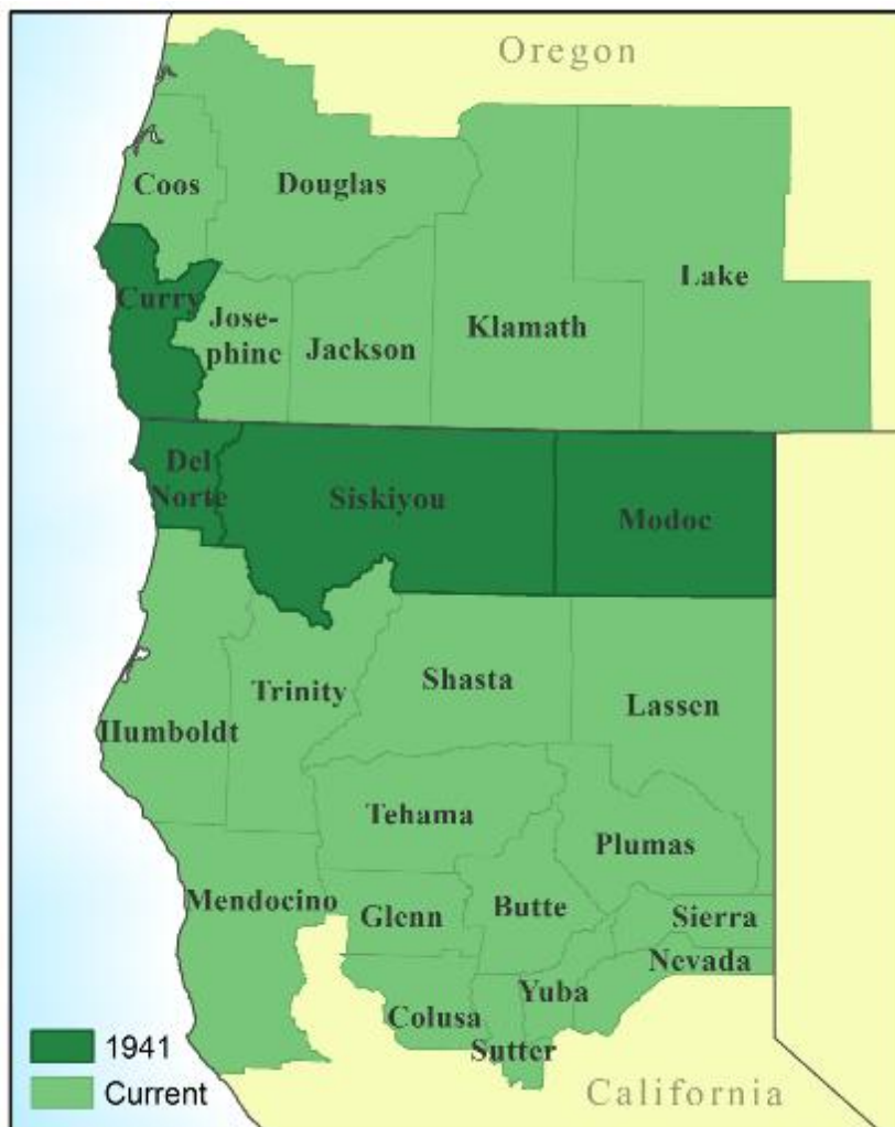
Figure 5. The territorial vision of the current State of Jefferson secessionist movement is far greater than that of the 1941 movement (map by Connor Mullinix).

Understandable are the anxieties of some researchers in engaging with a regional construct so closely associated with a reactionary political movement. However, the underlying circumstances driving the secessionists’ complaints are certainly deserving of scholarly inquiry.