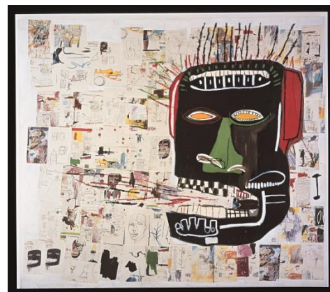
6. Jean-Michel Basquiat Glenn, 1984 Private collection.