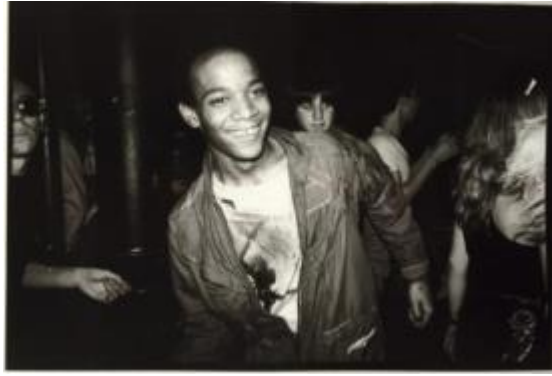
11. Jean-Michel Basquiat dancing at the Mudd Club, 1979.