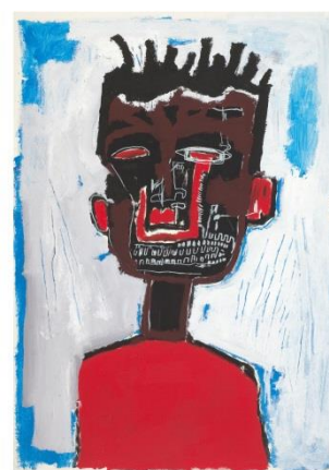
8. Jean-Michel Basquiat Self Portrait , 1984 Private collection. © The Estate of Jean-Michel Basquiat. Licensed by Artestar, New York.